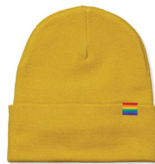
HAT 175,- More colors available