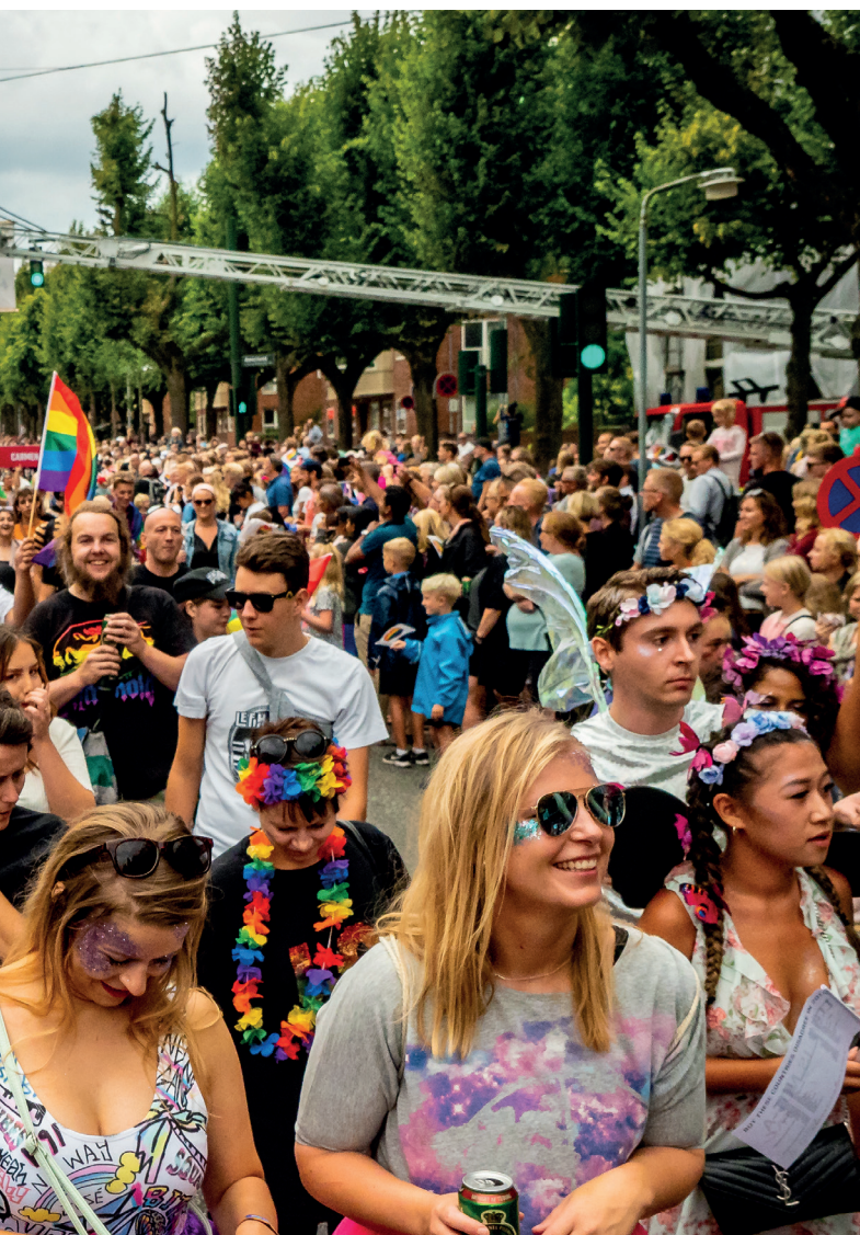
Copenhagen Pride Parade 13:00 - 16:00

Location: SLM Copenhagen, Lavendelstræde 17 (back building), 1462 Copenhagen K