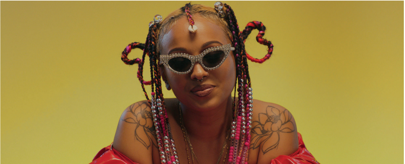
Wu Tsang, Into A Space Of Love (2018)