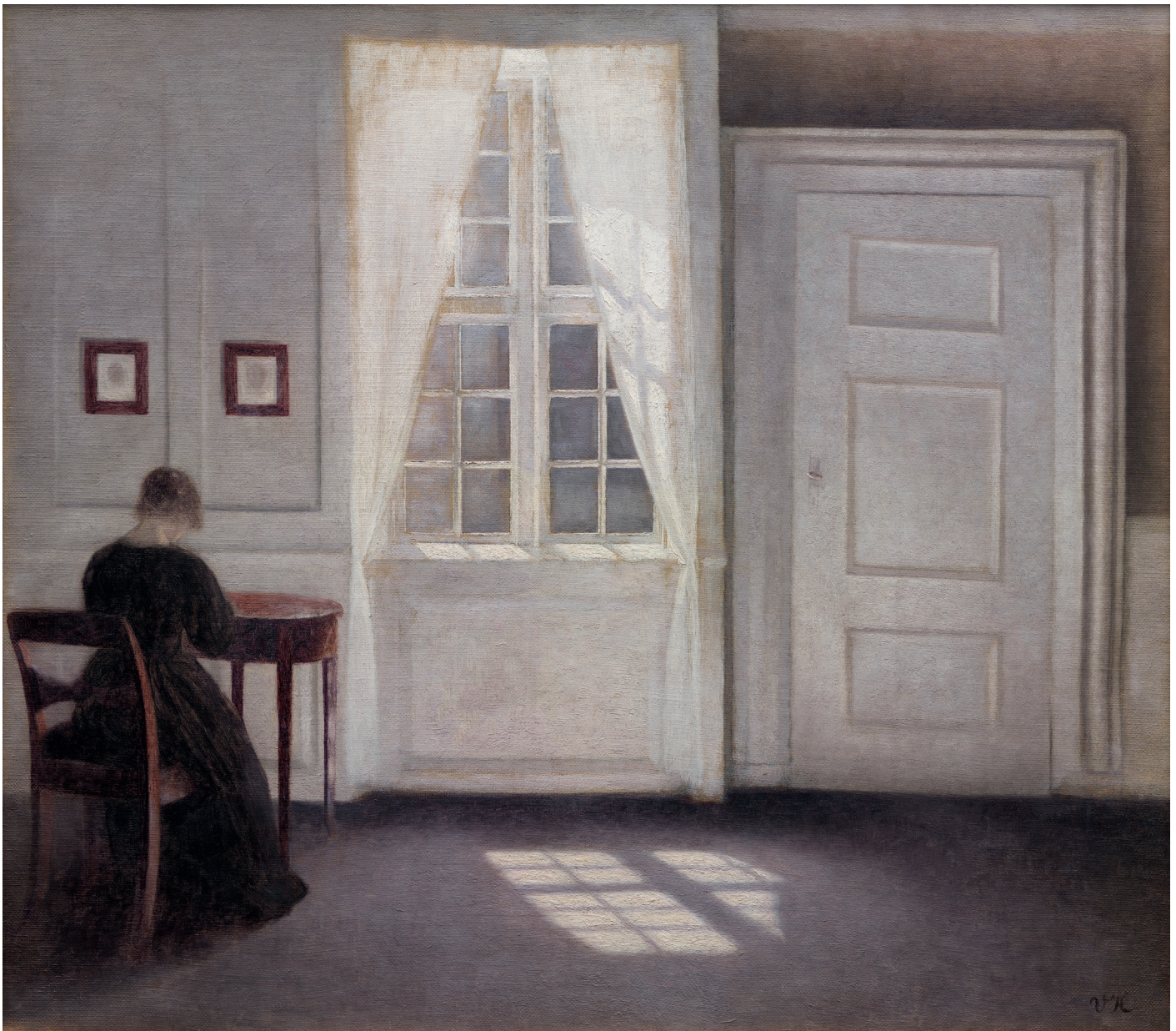
Vilhelm Hammershøi, Interior in Strandgade, Sunlight on the Floor, 1901.

When: Tuesday - Sunday in Pride Week from 10:00 - 18:00 (Wednesday until 20:00).