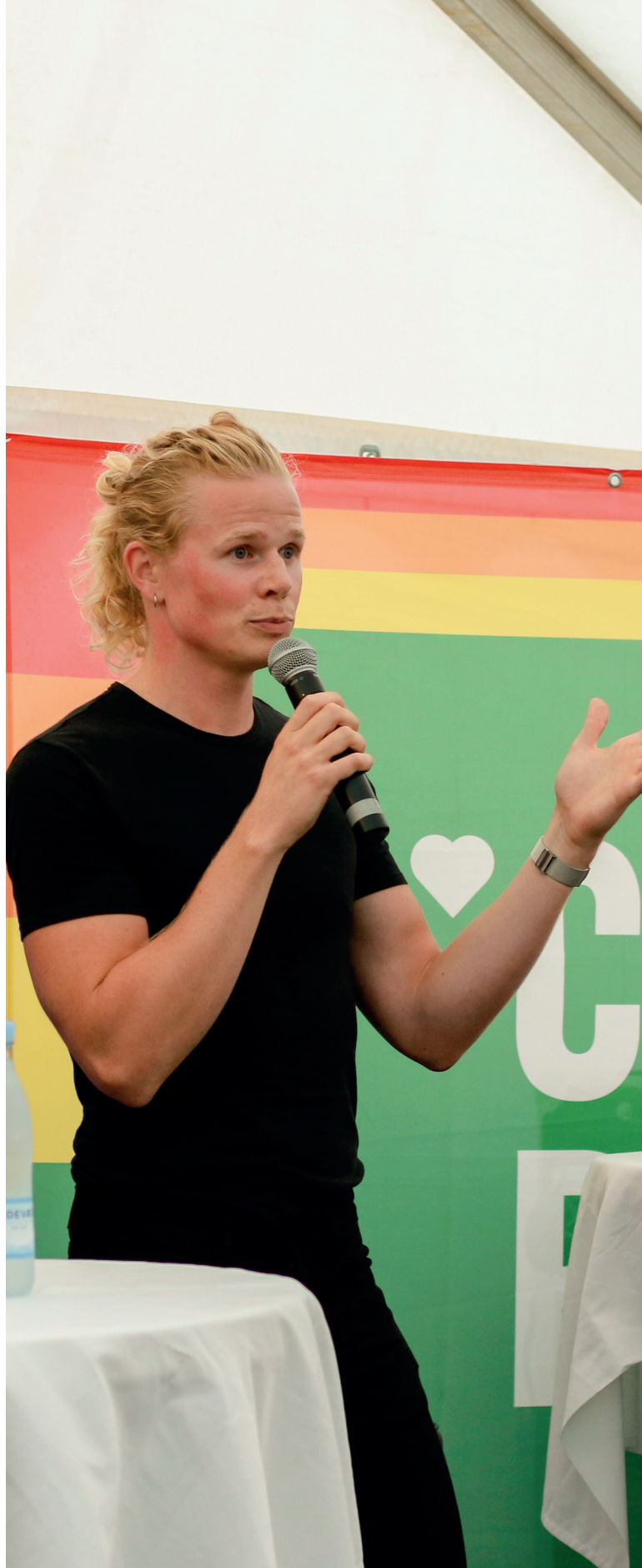
Photo from Copenhagen Pride's human rights program 2018